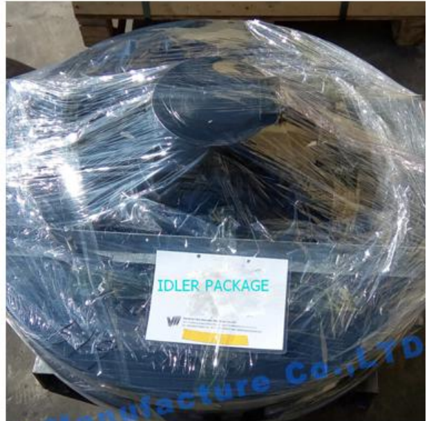
Each Package is wrapped in Thin film, and put shipping marks on the packages.