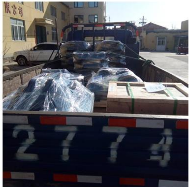
Parts are delivered to Port