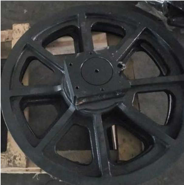
2pcs Sprockets are packed in one Pallet