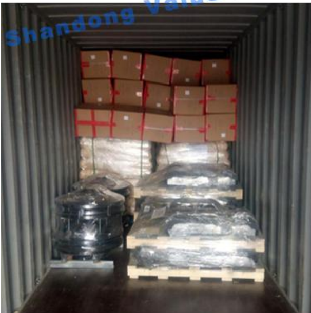
Parts in the Container